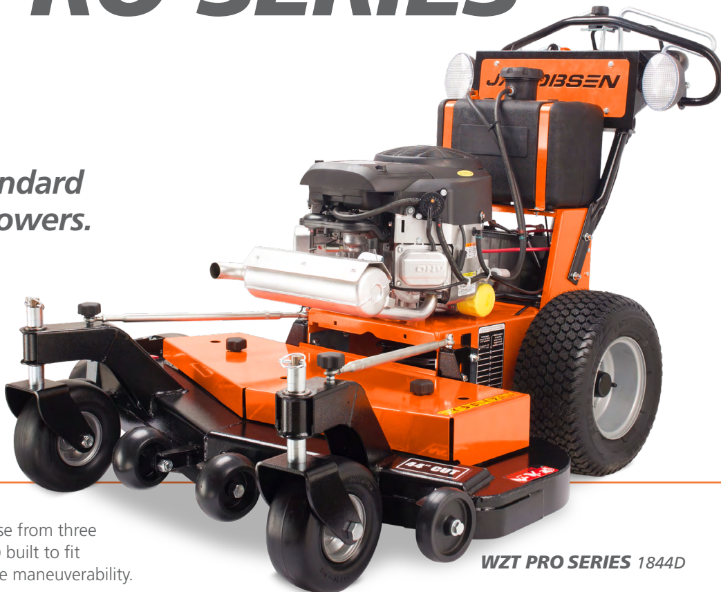
WZT PRO SERIES 1844D

Jacobsen expands the product line for 2015 with the all new WZT Pro Series for commercial contractors who need to make a big impact with a small footprint. Complement your existing zero-turn fleet with the WZT Walk-Behind.