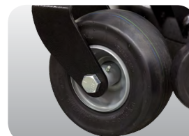
Service Access – Greaseable front wheels and spindles for easier maintenance.