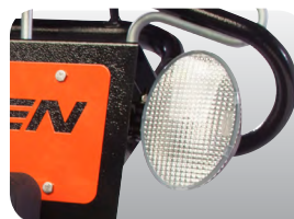
Light Kit – Standard on dual-drive models.