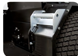
Hillside Footsteps – Keep your balance while accessing hillsides.