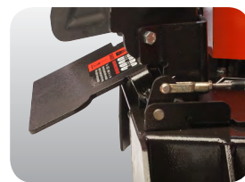
OCDC – Open and close the discharge chute on command.