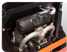
Vanguard® Engine – 26 HP commercial engine.