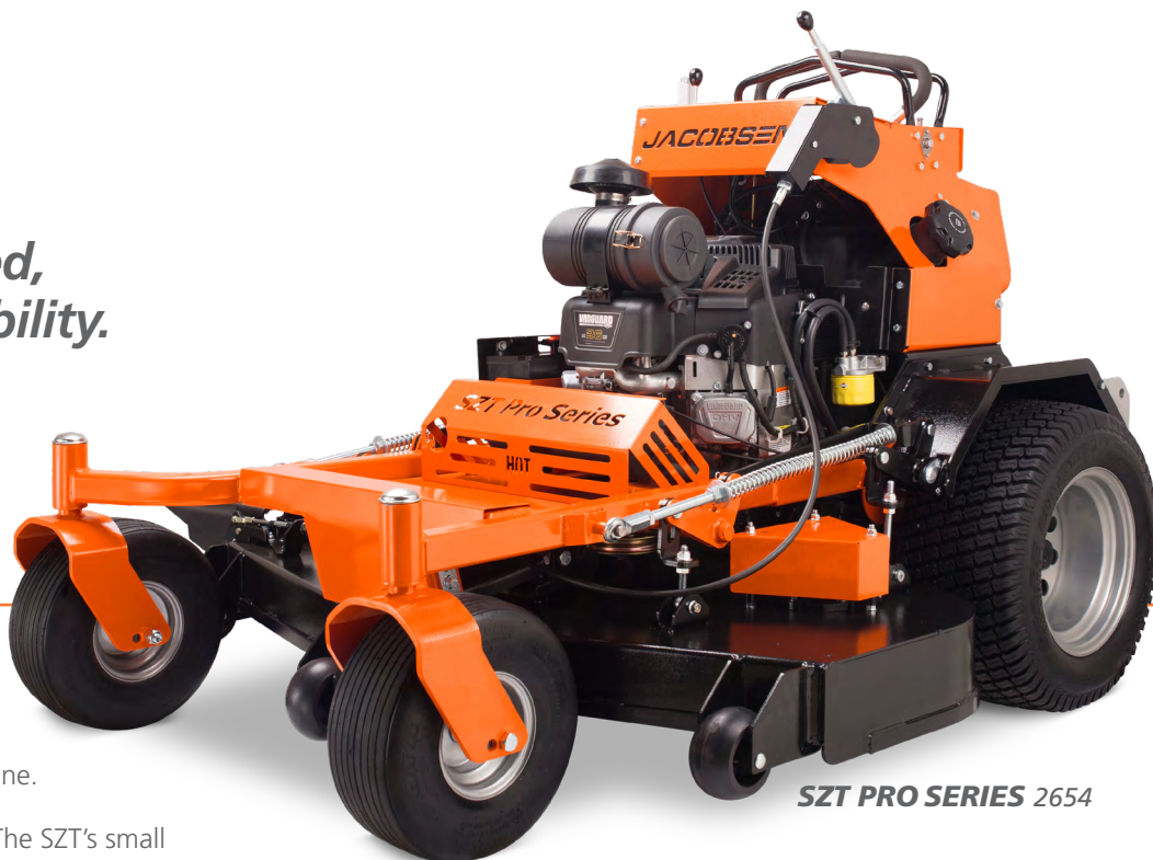
SZT PRO SERIES 2654