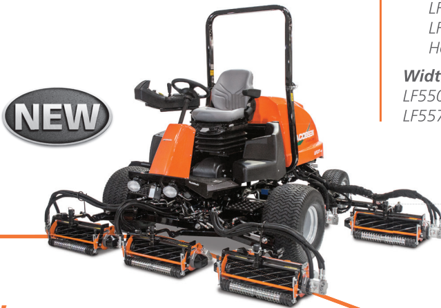
LF577™ 4WD shown with premium seat & 7" reels