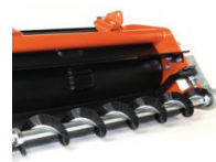
POWERED REAR ROLLING CLEANING BRUSH