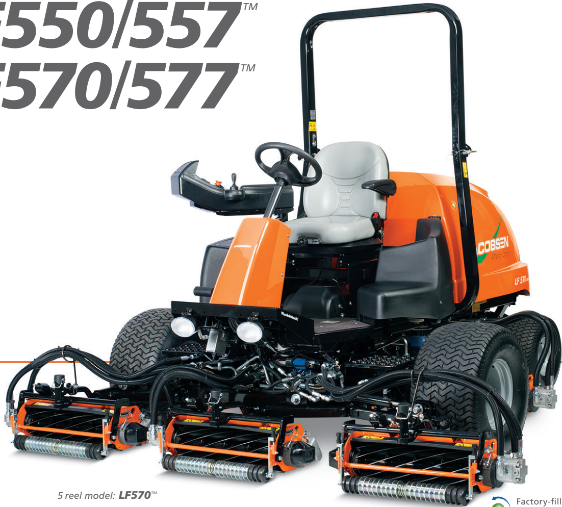
5 reel model: LF570™

Factory-filled with GreensCare Biodegradable Hydraulic Fluid