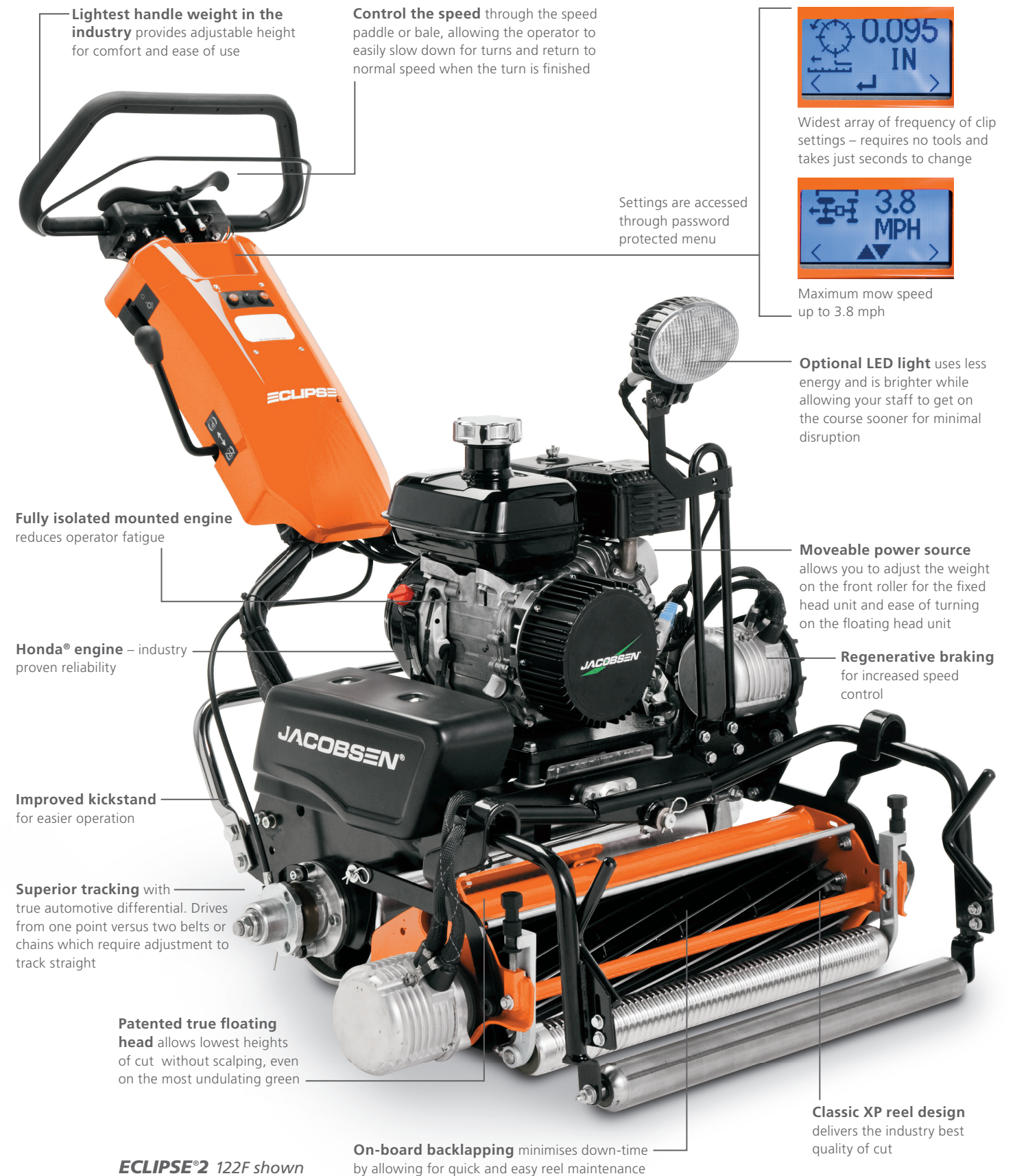
ECLIPSE ® 2 122F shown