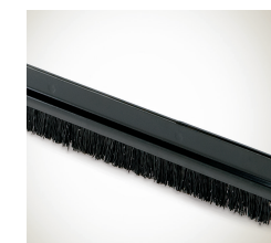
FINE BRISTLE BRUSH