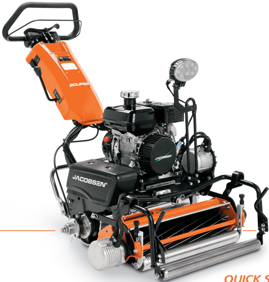
ECLIPSE® 2 122F

Jacobsen’s new ECLIPSE® 2 offers best in class quality of cut, industry leading productivity and customised controls.