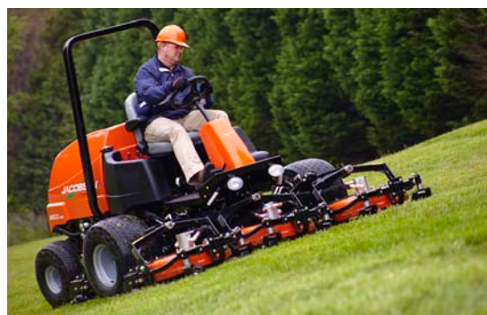
AR522 with SureTrac 4WD

*Engine horsepower is provided by engine manufacturer. Actual operating power output may vary due to conditions of specific use.